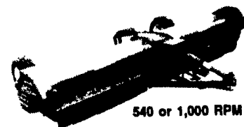
540 or 1,000 RPM

If Fuel Economy and Soil Conservation Are Concerns Of Yours, Buy Brillion