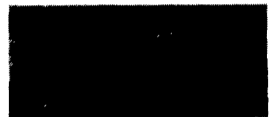
1993 MACK MODEL RD6885 10-WHEEL DUMP TRUCK; E7-350 Engine; Fuller 8-Speed Trans.; 16x44 Axles; AC; Camelback Suspension; Hewey 15 Ft. Heated Steel Body With Air Gate And Vibrator; 28,000 Original Miles.