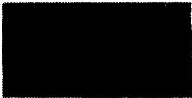
Two (2) 1993 CAT 953B TRACK LOADERS With Full Cab, 2 1/2 Cubic Yard Buckets. Only 1950 Original Hours Each.

ALL THIS EQUIPMENT WAS BOUGHT NEW BY BLUE LAKE BUILDERS