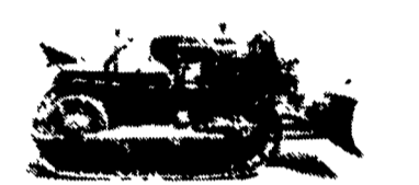
OLIVER HG CLETRAC With Dozer Blade..Completely Restored.