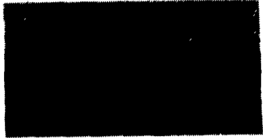
1994 CAT 320-N HYDRAULIC EXCAVATOR With 24" Trenching Bucket; 800 Original Hours. Also 42" Trenching Bucket To Be Sold Separate.