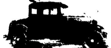
1931 FORD COUPE

1994 JOHN DEERE 410-D BACKHOE; 4-Wheel Drive; Extend-A-Hoe With 24" H.D. bucket And Aux. Hydraulics; Only 950 Hours. Also A New 24" Hensley Rock Bucket; John Deere 36" Bucket. TWO (2) 1993 20-TON EAGER BEAVER TRAILERS. Both Are Model 20 HAL; 24 Ft.; Tandem Axle And Low Profile Tires. 1986 MACK RW713 SUPERLINER TRACTOR With Wetline; E9-450 V8 Maxidine Engine; Mack 9 Speed Trans.; 20x44 Axles; 195,000 Miles. 1989 RODGERS DETACHABLE LOWBOY; 42 Ft.; 35 Ton; New Rubber. TWO (2) 1993 CASE 1840 DIESEL SKID LOADERS; Only 430 Original Hours Each. 1984 OWENS TANDEM AXLE TRAILER; GVW 9800 Lb. 1993 CASE 1845-C DIESEL SKID LOADER; 480 Original Hours. 1994 FORD XLT 4X4 PICKUP; Loaded; Trailer Brake Hookup; Class 4 Receiver Hitch; Toolbox; Fuel Tank; Only 6500 Miles. 1970 GMC 12' DUMP TRUCK. 1988 3000 LB. TRAILER. 1994 POLARIS 300 4X4 FOUR WHEELER. Two (2) EZ-GO GOLF CARTS. TWO (2) FIBERGLASS PABBLEBOATS. 1931 FORD SEDAN.