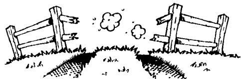
His fence got in the way of your 4-wheeler.