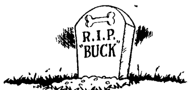
You just ran over his dog.