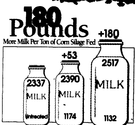
Fat corrected milk (3.5%) Washington State Trial Data