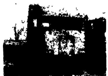
1990 PETERBILT 362, 90" BBC; CAT 3176, 325 HP; BFA 12F4 Front Axle, 12,000 Lbs.; Eaton DS 402 Rear, 40,000 Lbs., RT012809B Trans., Peterbilt Low Air Leaf