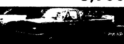
89 FORD F150 WORK TRUCK $4,990 6 Cyl., Auto, PS, 49,308 Miles