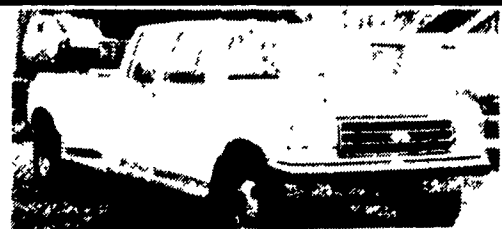
90 FORD CREW CAB DUALY $12,900 460 EFI, Auto, PS, AC

311 Route 15 Dillsburg, PA 1-800-440-4433 1-717-432-2918 Notary Public Temporary Tags