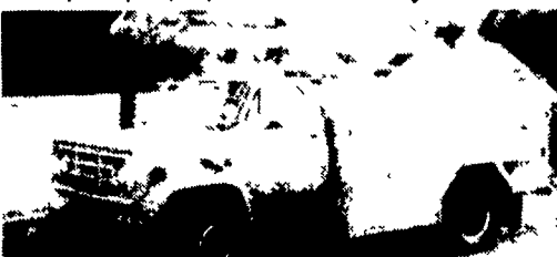
85 GMC 7000 36' BUCKET & TRUCK PLATFORM HEIGHT $12,500 8.2 Diesel Allison, Auto