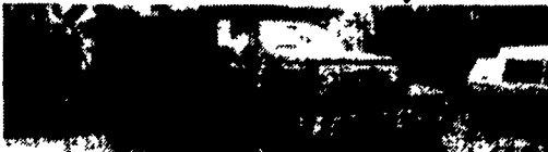
89 CHEV C-70 $14,900 12' Dump, 366, V8, 5&2, 28,000 Orig. Miles, 25,900 GVW