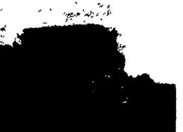
1989 FREIGHTLINER FLT-95, 2 Axle Tractor, 3406 Eng, RTX1609B Trans., RS23 1160 R Axle, Spring Susp.