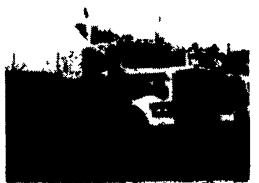
1984 KENWORTH W900, Eng, NTC 400, Trans, 13 Speed, R. Axle 38,000 Lbs., Air Ride