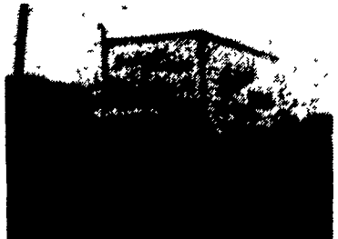
1979 GMC BRIGADIER 3208 Cat 210 HP, 5 Speed, 2 Speed Rear, 48,000 Lb. GVW, Tag Axle, 20' Van Body