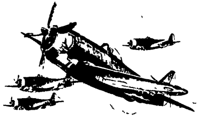
The P-47 Thunderbolt—also called the "Jug." Proven in combat one of the most rugged, powerful and reliable fighters ever built.

All without hurting your soybeans. See us soon for SQUADRON.