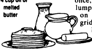
Makes about 20 4" pancakes.

Mix together the dry ingredients. In a separate bowl, lightly beat eggs, then mix in milk, brown sugar, and oil. Make a well in the dry ingredients and add the wet ingredients all at once, mixing until large lumps disappear. Cook on a lightly greased griddle over medium-high heat.