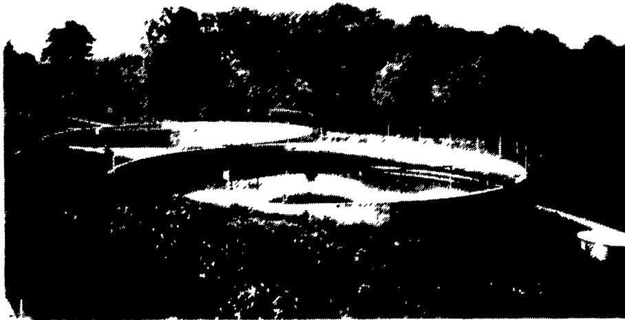
Partial In-Ground Tank Featuring Commercial Chain Link Fence (5' High - SCS approved)