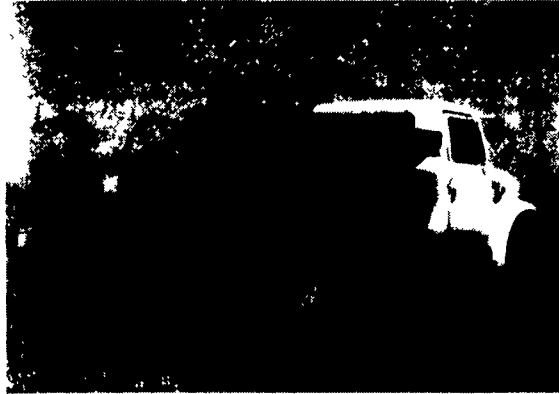
New GVM TranSpread