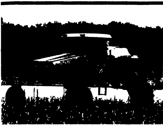
Melroe's New 3430 Spracoupe