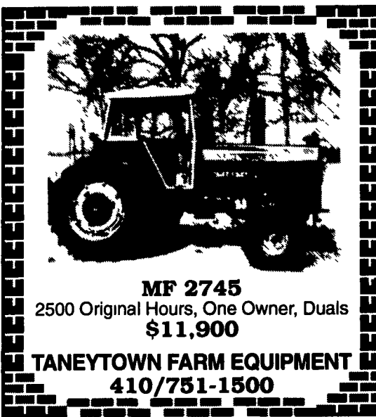
MF 2745 2500 Original Hours, One Owner, Duals $11,900

Snow blower, 3pth, HD, 7 1/2' twin augers, $2,100, OBO. (717)369-2540.