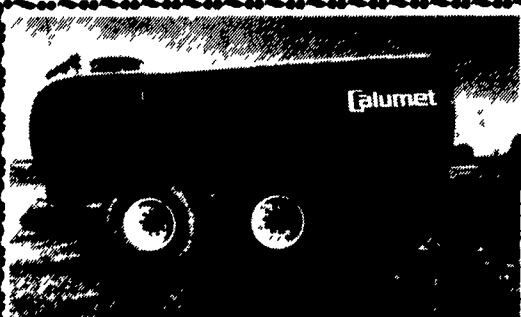
SPREADER, EXCELLENT CONDITION 50x20, 30 Ply Flotation Tires $6,400 OBO 814-632-9431

JD 4455 Cab, P/S, Loaded, Exc. Cond..... $45,000 NH 1499 haybine, 850 hrs. excellent..... $22,500 JD 40, 3pth..... $1550 JD A, good condition..... $1550 Farmall 300.... $1150 (914) 895-3995