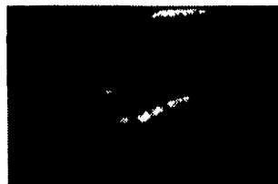
1988 443B BOBCAT 1681 Hrs., Diesel

COMING IN.... IR 185 Compressor Wacker Duomat Walk Behind Rollers, Diesels Cat AP200 Paver, Deutz Diesel