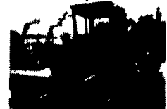
Athey 7-12D Belt Loader, JD Diesel, Hydrostatic, Stock Pile Front End. $25,000

COMING IN.... IR 185 Compressor Wacker Duomat Walk Behind Rollers, Diesels Cat AP200 Paver, Deutz Diesel