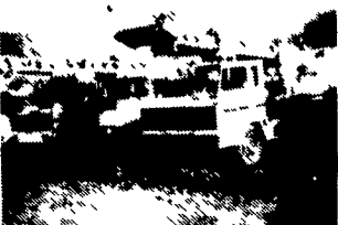
GRADALLS G-440 - Ford Gas Down Det. Diesel Up Remote; G-600 - Det. Diesel Up & Down Remote; G-660 - Chrysler Gas Down Det. Diesel Up Remote - Nice Machine