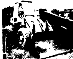
605 FIAT ALLIS 4WD LOADER 2 1/2 Yd. bucket - E-ROPS Nice Clean Tractor

Many Pieces Not Listed! If You Don't See It - Give Us A Call!