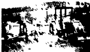
HUBER MAINTAINERS M-500 Gas.....$5,500 M-600 Gas.....Just In M-700 Loader-Wide Tires...$9,500

We Buy & Sell Huber Maintainers For Parts M-52's-500's-600's-700's-800's