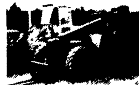
644 LULL 4WD 4 Wheel Steer - Shooting Boom Perkins Diesel - 6000 Lb. 34' Reach