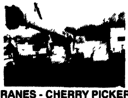
CRANES - CHERRY PICKERS RT-58 Grove - Detroit Power 60' Boom - Cab - 4x4 - 14 Ton 125 Gallon - Gas 60' Boom Cab - 4x4 - 12 1/2 Ton 410 Austin Western - 10 Ton Gas - 4x4 - Cab...$7,500

We Buy & Sell Huber Maintainers For Parts M-52's-500's-600's-700's-800's