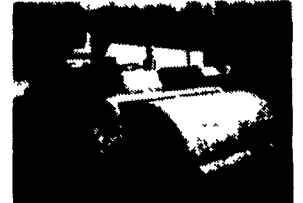
RAYGO 400 VIBRATORY ROLLER Detroit Power, Smooth Drum, Drum Drive