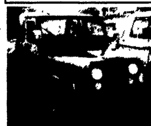
1984 CJ7 JEEP 4 Spd., 8 Cyl., Chrome Whia., Class II Hitch, New Top, Nice Clean jeep