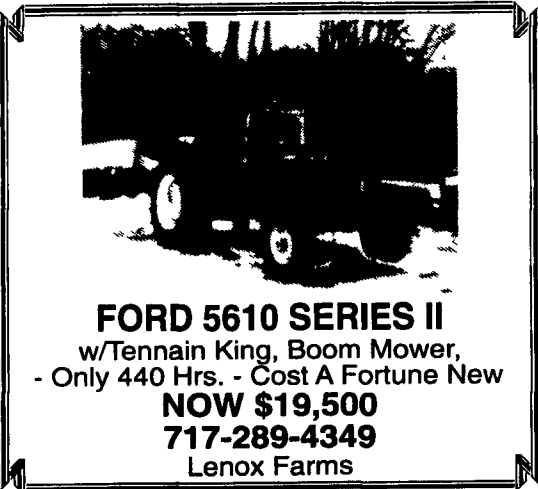
FORD 5610 SERIES II w/Tennain King, Boom Mower, - Only 440 Hrs. - Cost A Fortune New NOW $19,500 717-289-4349 Lenox Farms

WOOD SPLITTER 3 pt. vertical style, 28", $750. 410-833-9091