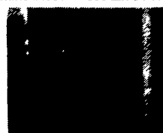
Tow Motor Forklift 4000 Lb. Cap., LP, 130" Lift Power Shift, Cushion Tires $2,500