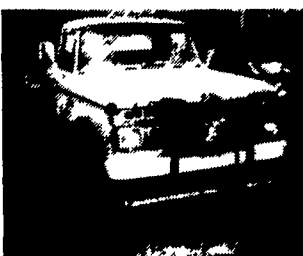
1966 F350 DUMP V8 352, Gas, 4 Spd., 8' Snow Plow