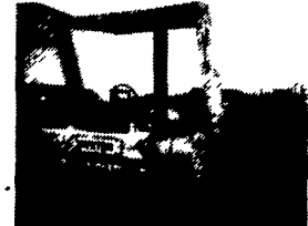
1986 HYSTER C12B Sheep's foot, Detroit dsl