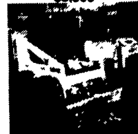
1988 BOBCAT-843 SKIDSTEER Diesel-Lights-Aux. Hyd. Nice Clean Low Hr Machine