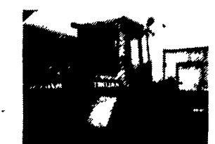
TROJAN 1500Z EROPS, Bucket & Forks