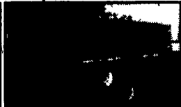
4 Horse Stock Trailer