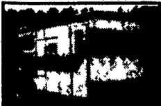
Two horse with 5 ft. dressing room