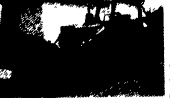
Fiat FL10C - 1980 - Rebuilt Transmission, Very Good U/C, Nice Machine $18,500

WANTED: Good Late Model Construction Equipment Need S/N And Price When You Call Lease Purchase Available On Most Machines