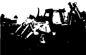
1985 Case 580E, Cab, 4x4, Extendahoe, Clean, Low Hours $26,500