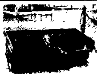
Fox Brady Cinder Spreader, Tow Type, Ground Driven, Pintle Hitch $1,000