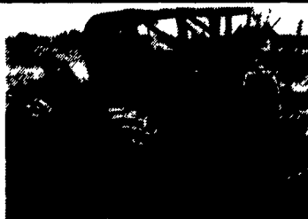
Athey S70 Log Skidder, Diesel, Winch, Needs Paint, Running Condition $6,900