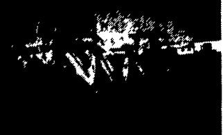
Case W18 Loader, 1977 - Operating Condition $18,500