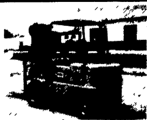
Cat V60B Forklift, Diesel, Sideshift, 6000 Lb., Air Tires, Runs Very Good. $10,500