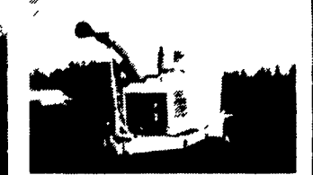
Chipmore Diesel Chipper, Rebuilt Engine, Runs Very Good. $6,900