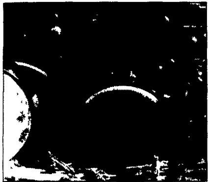
New unit-mounted double-disk fertilizer opener — Work in clean-till conditions? Go with this new, economical, unit-mounted double-disk opener.