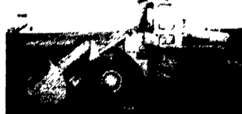
Fiat Allis 745 B, Rebuilt Motor, 4 Yard Bucket $17,000

WE ARE BUYERS FOR CONSTRUCTION EQUIPMENT NEEDING REPAIRS