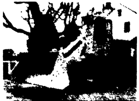
Ford A66 Wheel Loader $20,000