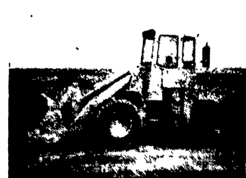
Ford A64 2 Yard Bucket, Excellent $18,500