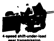
4-speed shift-under-load gear transmission