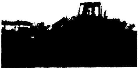
ALLIS CHALMERS 840 Diesel Wheel Loader w/Forks, Bucket, Solid Tires $13,500

5859 Urbana Pike Frederick, Md. 21701 301-663-3185