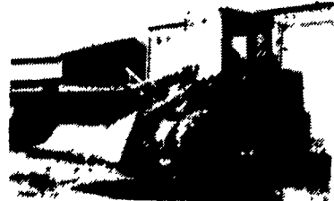
JOHN DEERE 544B WHEEL LOADER w/Side Dump Bucket, EROPS $21,500