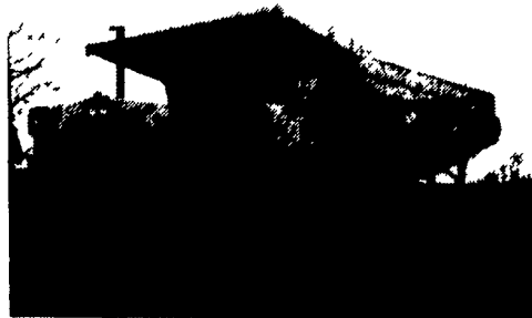
(2) WABCO 35 Ton Trucks 380 HP Cummins Allison 5860 Auto. Trans. $14,500 Each