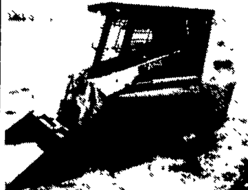
1990 Case 1840, 2800 Hr. Good Rubber, Aux. Hyd., Excellent Condition