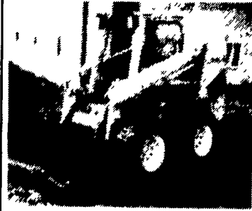
1989 Gehl 5625 new rubber, aux. hyd.

White 5000 lb forklift, gas, air tires, PS, 12' lift, $5700 717-345-4882.