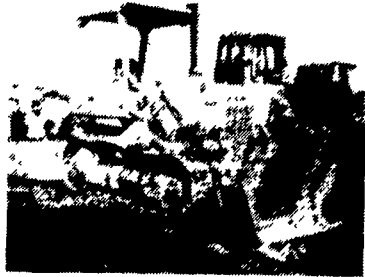
CATERPILLAR 955L Crawler Loader w/4-1 Bucket, OROPS $16,500