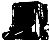
Round Balers $500 - $2300