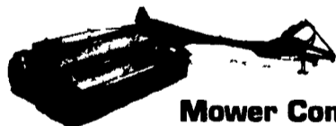
Mower Conditioner $700 - $2100