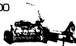
Forage Harvesters $600 - $1800