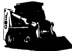
Skid Loaders $100 - $ 800