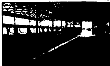
3 Row Freestall Barn

8 ft. Deep Pit with Waffle Slats & Rubber Dust Mattresses.