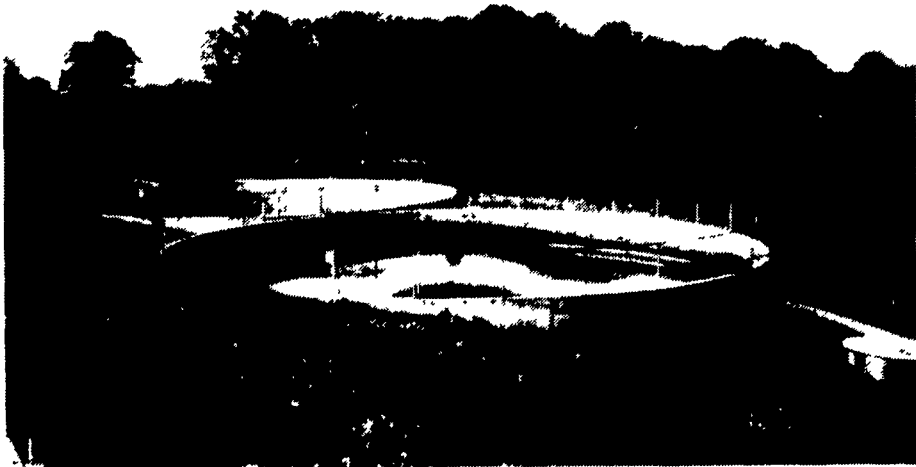
Partial In-Ground Tank Featuring Commercial Chain Link Fence (5' High - SCS approved)