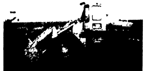
Flat Allis 745 B, Rebuilt Motor, 4 Yard Bucket $17,000