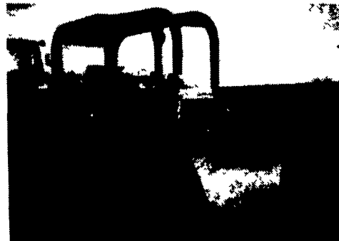
Cat 955K 85J Series $13,000