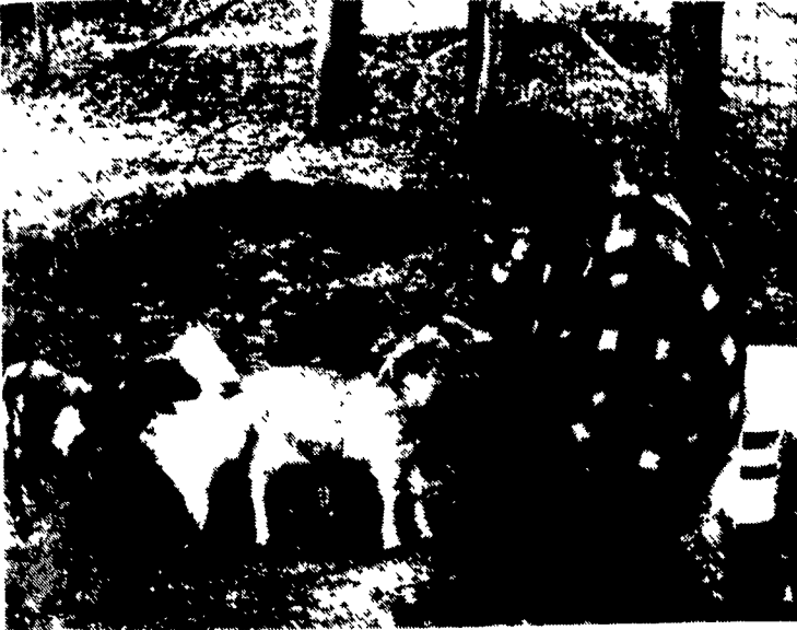
The kids line up for some affection from Judy.

They also have a menagerie of other animals including a llama, chickens, guineas, geese, rabbits, two horses, an assortment of cats, a Border collie, and several turkeys.