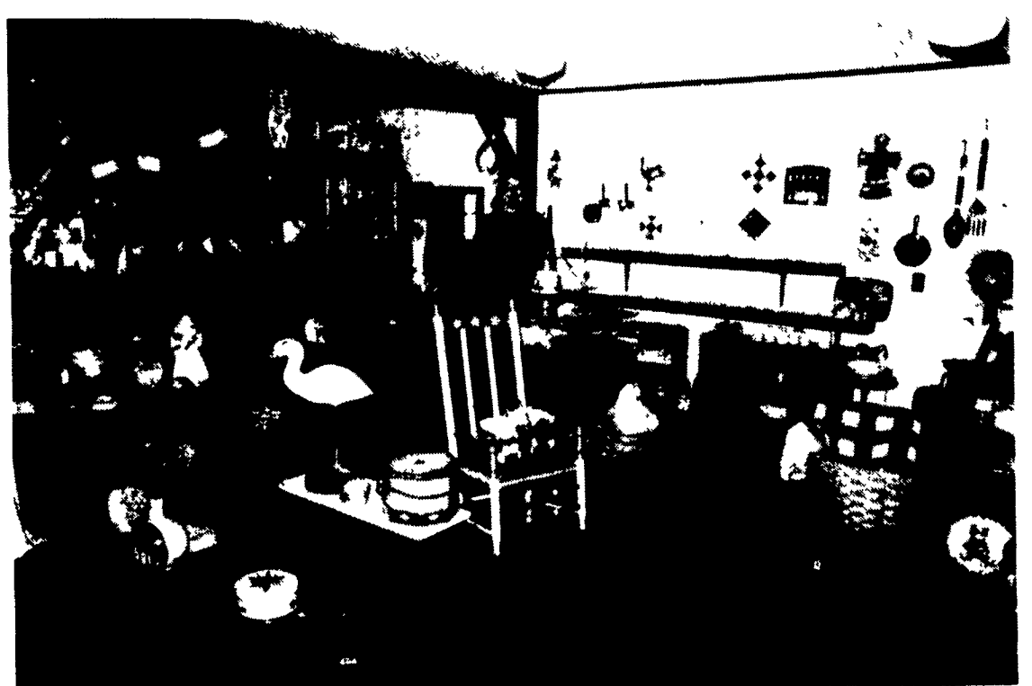
The shop includes a lot more than soap including the end results of Judy and Lee's many other talents.