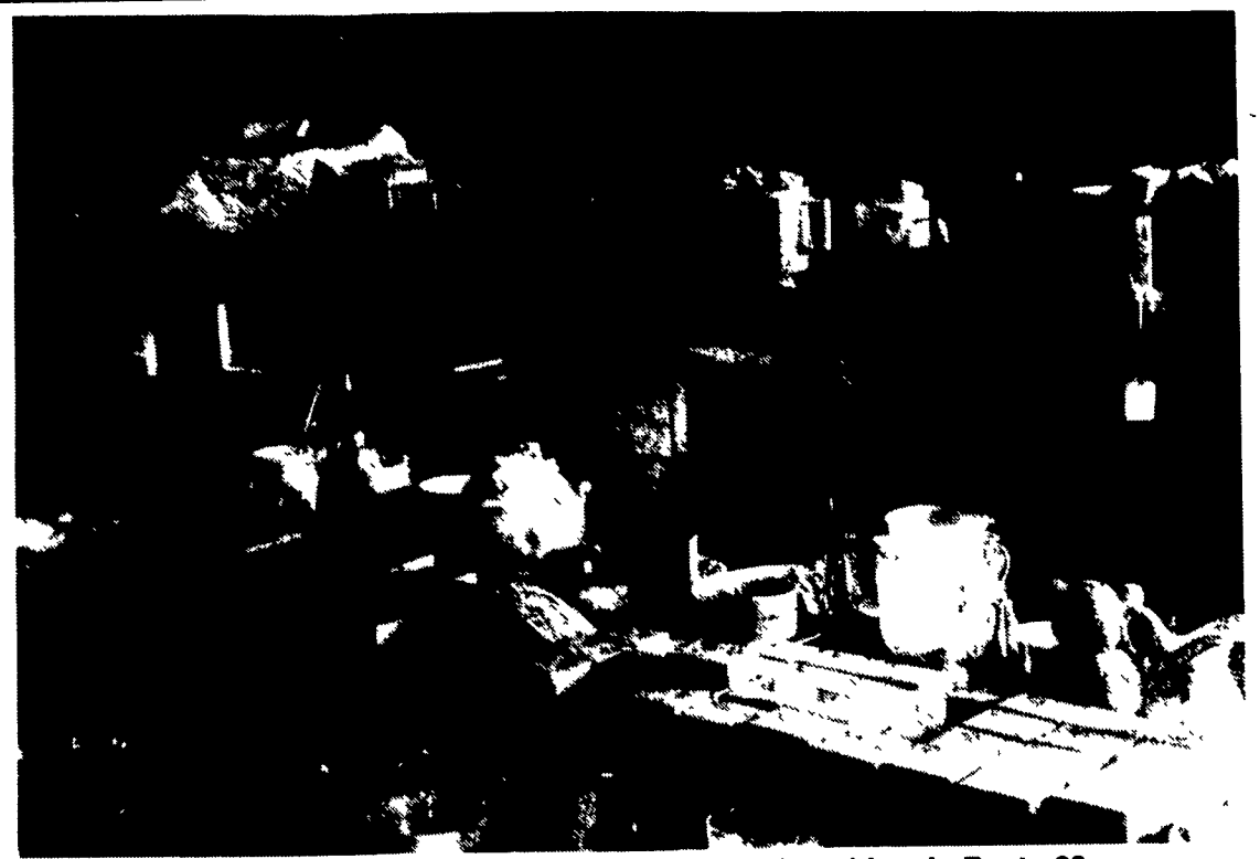
A view of Judy's soap in the shop located along historic Route 30.