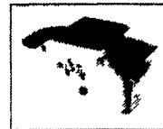
Model HGT 2 Hog Two-Drink Part No. 16259 31 1/2" x 20" x 8" Capacity: 80 hogs