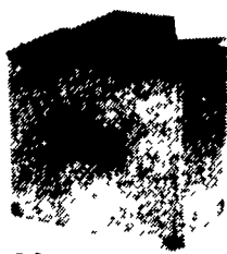
3 Cattle Fountain Designed for big service in small pens. Waters up to 100 head. Part No. 11255 17" x 28 1/2" x 26" high Part No. 12285 Electric (530W CSA approved) or Gas

Recapping Your Ritchie Fountains Makes Sense... And Saves Money!