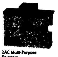
2AC Multi-Purpose Fountain Waters calves, sheep and goats. Perfect for box stalls, small lots or fences. Waters up to 40 cattle/100 calves. Part No. 12285 10" x 24" x 18" high Electric (280W CSA approved)