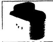
Model CT1 Cattle One Drink Part No. 16271 28" x 20 1/2" x 19" Capacity: 50 cattle