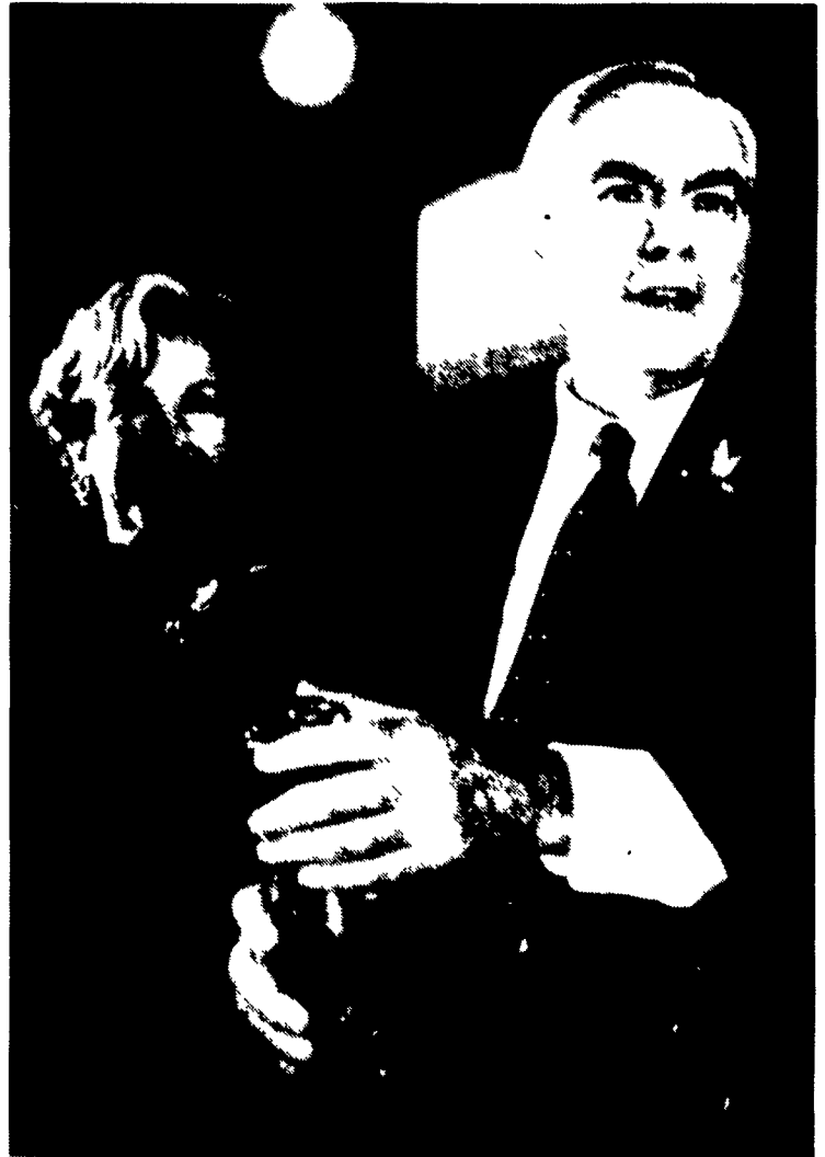
Gov. and Mrs. Casey received an antique milk bottle as a gift while preparing to ride into the large arena on a carriage pulled by draft horses.