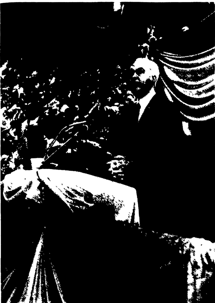
Gov. Casey gives the opening address in the large arena.