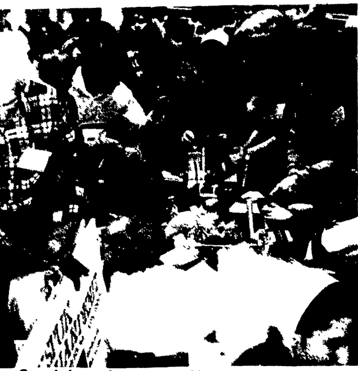
Crowds learn about wool making during sheep to shawl competition Monday evening at the Farm Show.