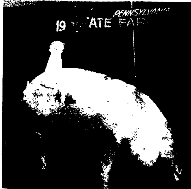
Reserve Chester White was shown by Grant Lazarus III.