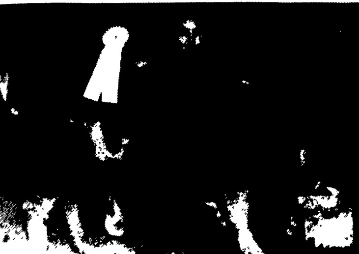
Reserve Spotted was shown by Ginger Kegg.