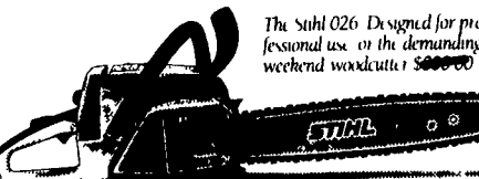
The Stihl 026 Designed for professional use or the demanding weekend woodcutter $699.00