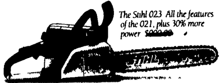
The Stihl 023 All the features of the 021, plus 30% more power $699.00