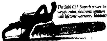
The Stihl 021 Superb power to-weight ratio, electronic ignition with lifetime warranty $699.00