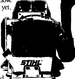
The Stihl BR-106 Powerful backpack blower. Anti vibration system low center of gravity $699.00

Better yet, talk to any man who owns a Stihl. He'll give you a more enthusiastic sales pitch than any ad we could ever write.