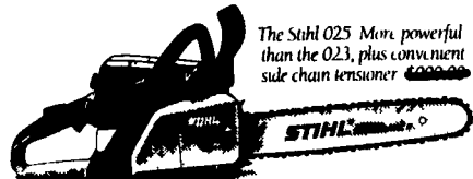
The Stihl 025 More powerful than the 023, plus convenient side chain tensioner $699.00