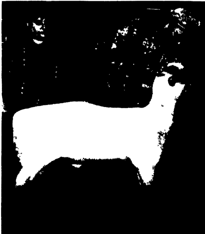
The champion Shropshire ram was shown by Wey Shropshires.