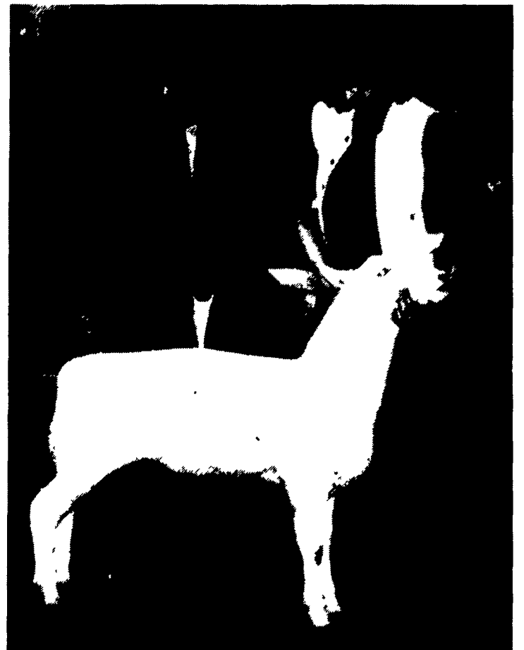
The champion Cheviot ram was shown by Erdenheim Farm.