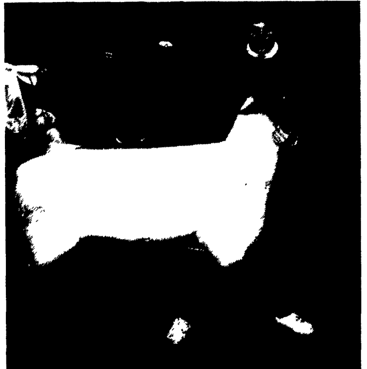
The champion Suffolk ram was shown by Breezewiew Farm, Atglen Chester County.