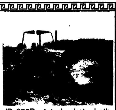
JD 655B 4-1 bucket, both hydrostatic rebuilt 9/94 (1 year warranty on hydrostat) $32,000

Coming Soon: (2) Case late model 1840 skid loaders, (2) Bobcat 743 Financing & Lease Purchase Available