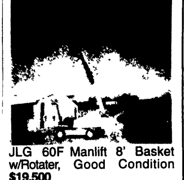
JLG 60F Manlift 8' Basket w/Rotator, Good Condition $19,500

Coming Soon: (2) Case late model 1840 skid loaders, (2) Bobcat 743 Financing & Lease Purchase Available