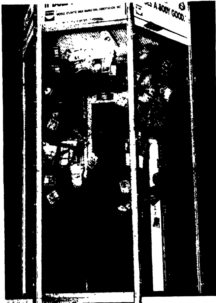
Dairy Derby contestant attempts to catch free money to keep. Several hundred dollars and more than $1,000 in U.S. Savings Bonds are released during the one-minute each contestant has to catch what they can. The trick is to catch the cash or bonds, because inside the cube, it's like standing in the middle of a tornado.