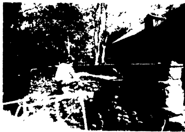
This Is THE ANSWER For A Structurally Sound Wall