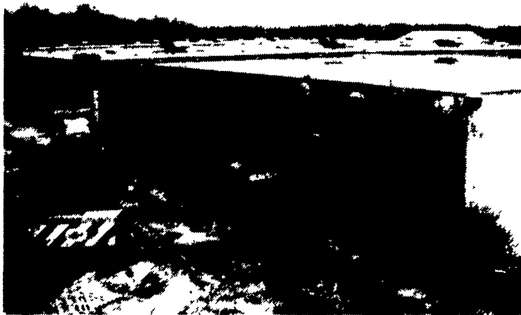
Block Wall Being Restored With Gunite

"The Concrete Specialists" Solve Your Problem As Shown in Picture