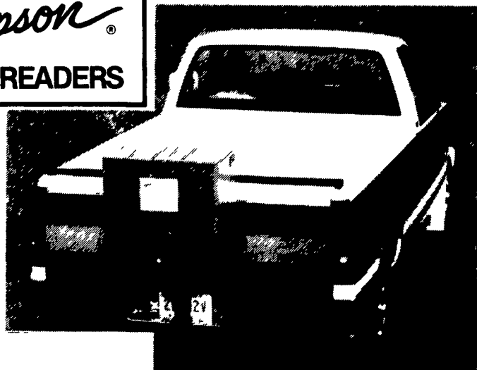
MODEL M3B 400R 3 BU. CAPACITY