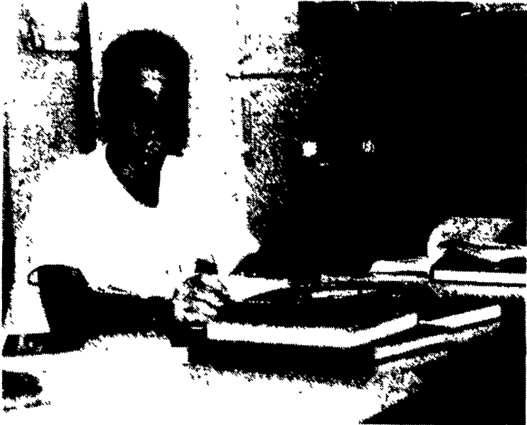
Ninth grade students say that the required agriculture course gives them a new respect for farmers.

becomes farther and farther removed from the tillers of the soil. As city limits stretch into suburbs and encroaching farmland, residents are prone to hold their noses at chicken house odors and complain about pesticide and insecticide use. That's because too many citizens don't know where their food