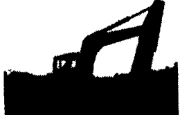
1980 JD 690B, 48" Bucket, 24" Pads, Runs Good, Good U/C $936.25 Lease Purchase