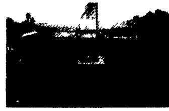
Sicard Snowblower, V8 Gas, Power, Fits Big Rubber Tired Loader $8,500 Or Offer