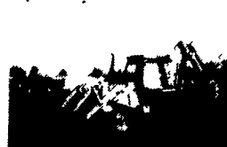
1985 Case 580E, Cab, 4x4, Extindahoe $883.25 Lease Purchase

REBUILDABLE BACKHOES All Take Major Work Ford 1801 - $2500 JCB 3CIII $3,500 IH 2400A - $3,500