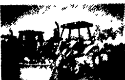
1987 Case 580K, ROPS, 2x4, Standard, 3400 Hours $794.93 Lease Purchase