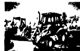
1988 Case 580K, Cab, 4x4, Standard, 3440 Hours $1,112.90 Lease Purchase