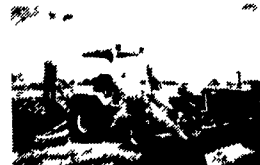
1985 JCB 1550, ROPS, 2x4, Extindahoe $441.63 Lease Purchase