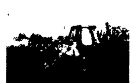
1982 Case 580D, Cab, 2x4, Standard, 3200 Hours $618.28 Lease Purchase