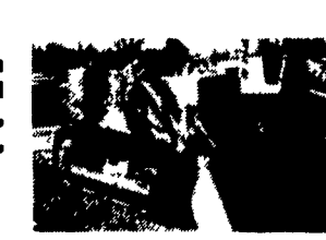
1968 Cat 941, Direct Start, Powershift, Pedal Steer, Runs Good $11,500