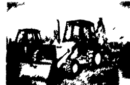
1989 Ford 655C, Cab, 4x4, Extindahoe, 4928 Hours $1,218.89 Lease Purchase