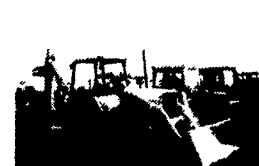
1985 JD 510B, 4x4, ROPS, Std., 4152 Hours $830.26 Lease Purchase