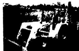
1985 JD 310B, ROPS, 2x4, Standard, 3700 Hours $512.29 Lease Purchase