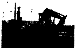
1978 JD 690B, 30" Bucket, 24" Pads, Runs Good, Good U/C $794.93 Lease Purchase