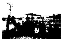
1983 JD 2150, ROPS, 2x4, Standard $582.95 Lease Purchase