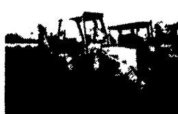
Case 580C, ROPS, 2x4, Standard, Rough As-Is Condition $267.53 Lease Purchase