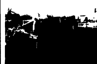
1989 New Holland 781 Skid Steer, Deutz Diesel, Runs Good, New 82" Material Bucket $14,500