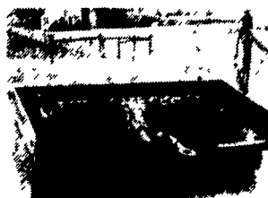
Fox Brady Cinder Spreader, Tow Type, Ground Driven, Pintle Hitch $1,000