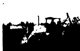
1984 JD 510B, ROPS, 2x4, Standard $476.96 Lease Purchase