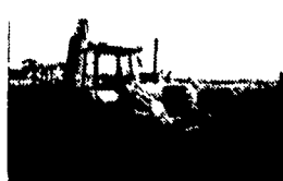
1984 JD 510B, Cab, 2x4, Extindahoe, 4110 Hours $759.60 Lease Purchase