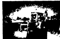
1980 JD 510, Cab, 2x4, Standard $582.95 Lease Purchase

• 36 Month • 1st & Last Payment In Advance • With Approved Credit • 10% Residual