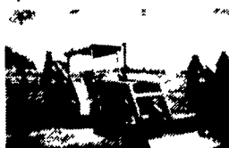
1973 JD 410, ROPS, 2x4, Standard, 5530 Hours $370.97 Lease Purchase