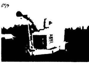
Chipmores Diesel Chipper, Rebuilt Engine, Runs Very Good. $6,900