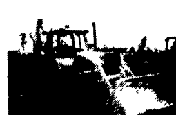
1987 JD 710B, Cab, 2x4, Standard, 5200 Hours $1,218.89 Lease Purchase