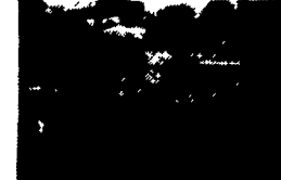
Nissan N150-2 Mini Excavator, Diesel, Low Hours, Runs Good. $317.46 Lease Purchase