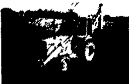
1987 Ford 655A, Cab, 4x4, Standard, 1700 Hours $1,148.23 Lease Purchase