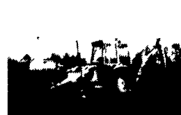
1987 Ford 555B, Cab, 2x4, Standard, 1000 Hours $794.93 Lease Purchase