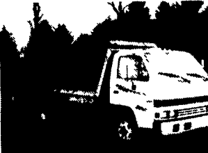
1992 Isuzu NPR Diesel Rollback, 17' Winch, Auto, Air $19,500