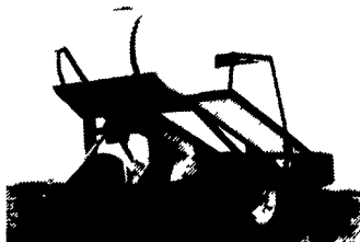
MODEL P150T WATER WHEEL PLANTER