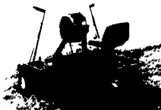
SUPER DELUXE FLATBED MULCH LAYER