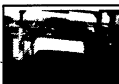
Farmland Bale Wrapper, Rented Some Reduced to $5,750