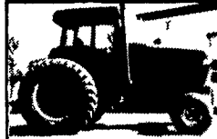
Magnum 7120 MFD ('92), 1330 Hrs., 3 Remotes, With Warranty