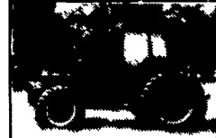
Magnum 7110 ('92) 1250 Hrs., 20.8x38 Radials, 3 Remote circuits With Warranty