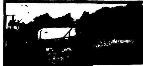
HARDI ESC SERIES

The ESC line of trailers offers all the basic yet unique HARDI features to satisfy the most economical applicator. 300 and 500 gallon trailers feature a centrifugal pumping system with adjustable agitation, EC-SC electric controls with motorized valves, constant pressure and a glycerin filled pressure gauge. Self-stabilizing manual fold booms from 35 to 50 feet are available on the 300 and 500 gallon models with single axle. The 500 gallon models with tandem axle also feature the Eagle hydraulic fold booms from 45 to 66 feet.