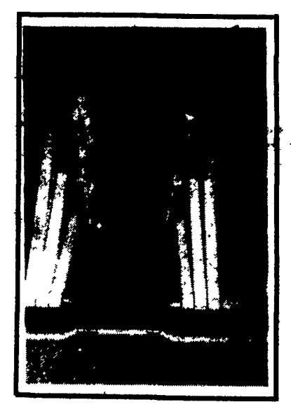
CHORETIME. 4 high Duracage with push-in doors and cage stands 8 ft. on center.

Chore-Time variable speed rubber finger collectors to a 24 inch PVC rod conveyor and 100 CPH Diamond farm packer.