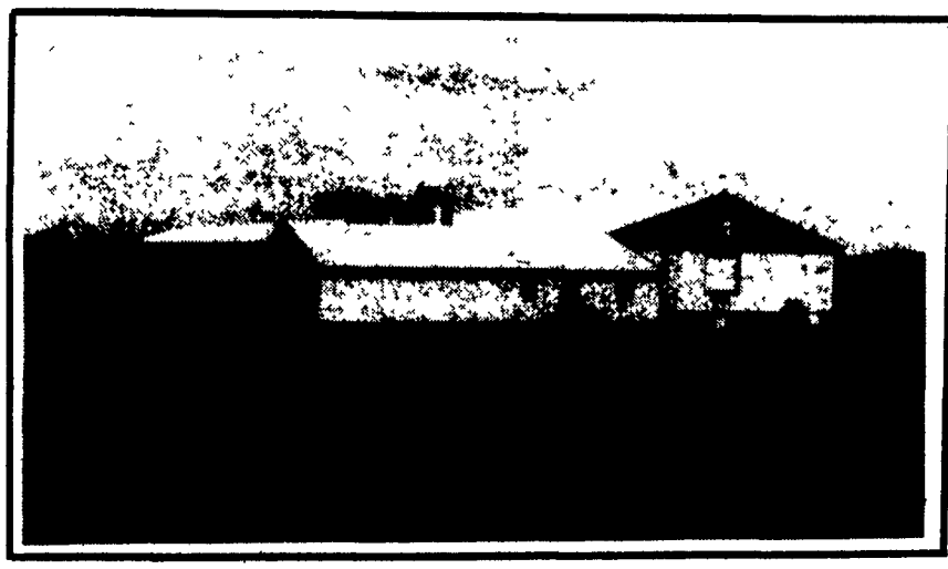
54'-8" x 616' High rise layer building with 40' x 60' egg packing and cooler room