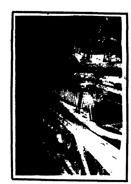
Notice egg trays are 3 1/4 inches away from birds to reduce jamups, and lip is two inches high to keep eggs from fall out.

CHORE TIME Galvanized after welded, cage floor. Chore-Time New style one inch higher Ultraflo feed trough. .