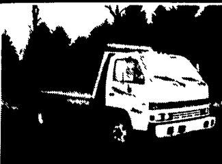
1992 Isuzu NPR Diesel Rollback, 17' Winch, Auto., Air. $19,500