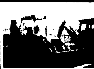
1985 JCB 1550 Extendahoe, ROPS, Runs Good. $12,500