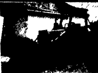
Fiat FL10C - 1980 - Rebuilt Transmission, Very Good U/C, Nice Machine. $18,500