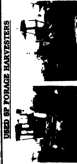
USED SP FORAGE HARVESTERS

• 7650 Field Queen Self-Propelled Harvester With Hay Pickup Head • 7650 Field Queen Self-Propelled Harvester With Hay Pickup Head