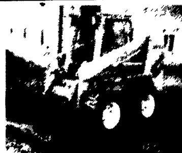
1989 Gehl 5625 new rubber, aux. hyd. $10,500

Taylor Forklift, 12,000lb., gas, pneumatic tires, 6' fork, $9500. 717/354-3105.