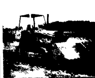
JD 655B 4-1 bucket, both hydrostatic rebuilt 9/94 (1 year warranty on hydrostat) $32,000