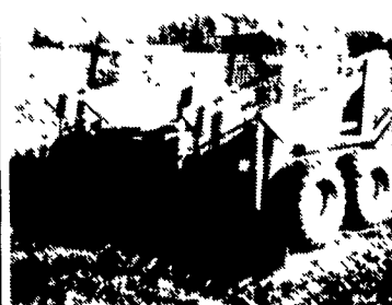
(2) Gehl 4615 Skid Loaders, 1989 - 1600 hr., 1990 - 1200 hr., excellent condition $10,500