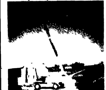
JLG 60F Manlift 8' Basket w/Rotator, Good Condition $19,500