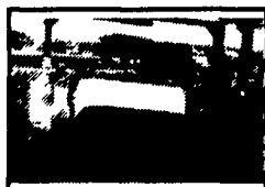
Farmland Bale Wrapper, Rented Some Reduced to $5,750