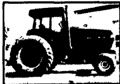
Magnum 7120 MFD ('92), 1330 Hrs., 3 Remotes, With Warranty