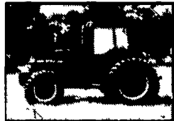
Magnum 7110 ('92) 1250 Hrs., 20.8x38 Radials, 3 Remote circuits With Warranty