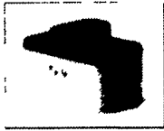
Model CT 2