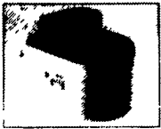
Model CT 1