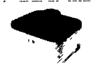
Model CT 4