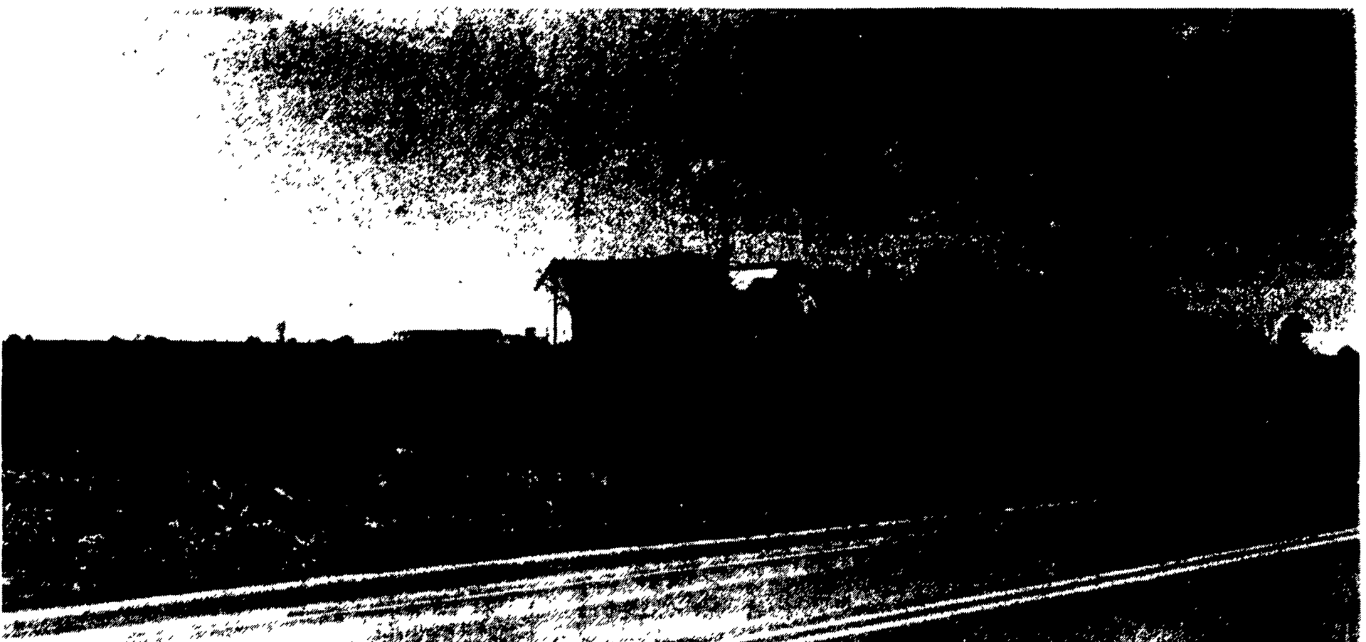
Along Route 322 east of Ephrata beyond Reidenbach Road.