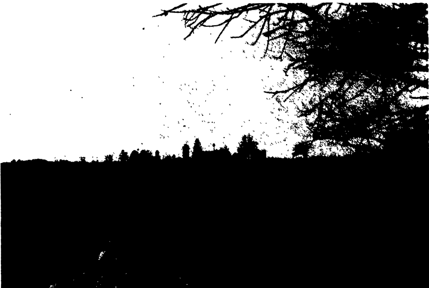
Down and up Long Lane Road southeast of Ephrata beyond Quarry Road.