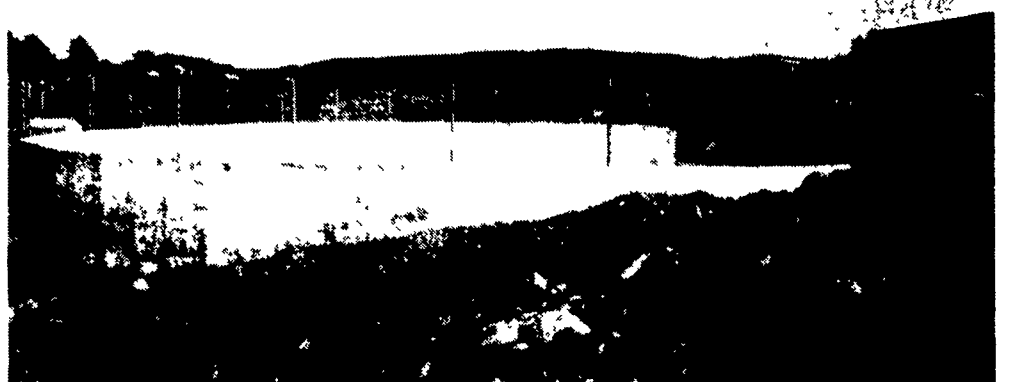
12' x 83' Diameter Circular Manure Storage

Round or Rectangular in Ground or Above Ground