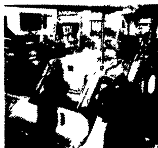
JD 670 4x4 w/Loaders, Only 90 Hrs., Excellent Condition