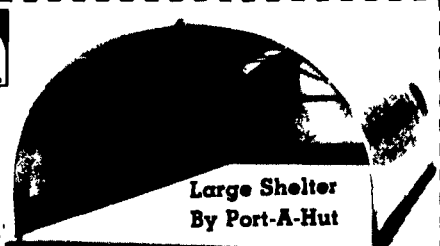
Large Shelter By Port-A-Hut

14 Peterson Dr, Storm Lake, Iowa 50588 712-732-2546 Manufacturer of quality, affordable hog and calf huts since 1963