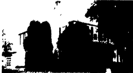
LOT SIZE: 2 ACRES M/L w/258' road frontage West Main St.

Second floor lg. storage area and an ATTACHED HEATED WORKSHOP. This workshop is insulated. Electric Heat.