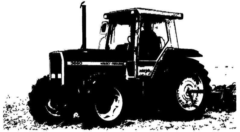
IN STOCK - MF 3660 with 140 hp* Quadram-combustion turbocharged diesel engine, Dynashift transmission, and much more. * Manufacturer's estimated PTO hp