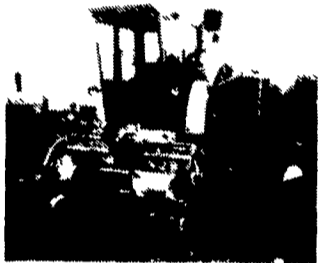
• 7650 Field Queen Self-Propelled Harvester With Hay Pickup Head