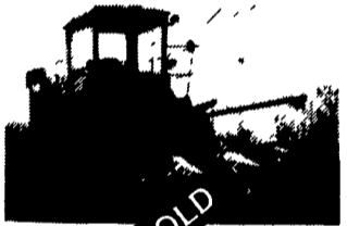
• 1991 NH 4WD S.P. Forage Harvester, 900 Hrs., 4RN Corn Head, 7 Ft. Hay Head, Like New!!