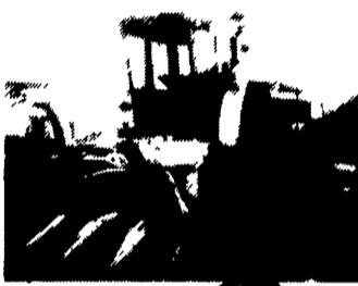
• 1985 Hesston Field Queen, 3RN Cornhead, 7' Hay Pickup